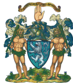
Chief's Coat of Arms