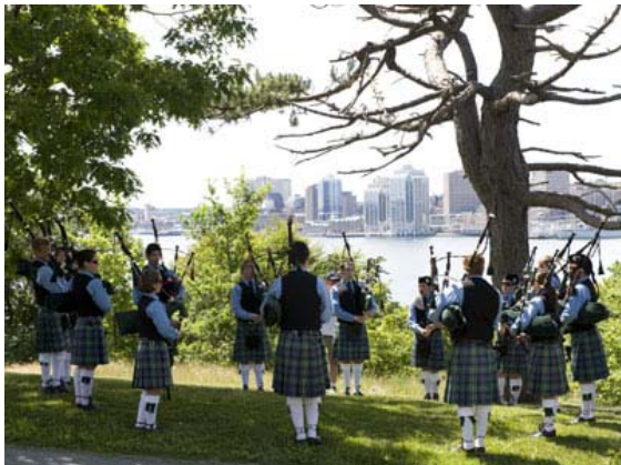
Band in Dartmouth above Halifax Harbour

In January, members of the Dartmouth & District Pipe Band had the opportunity to perform in Ireland at Temple Bar TradFest, Dublin's premier celebration of traditional music and culture. The 2011 festival ran from January 26 th to 30 th with its most ambitious program to date, offering more events than in any other year.