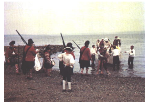
Re-enactment of Hector arrival (every August)

http://www.townofpictou.ca/hector_heritage_quay.html